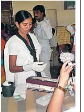
Medical personnel at the mass vaccination programme

Bharat used to work in a store in Modasa. "Bharat was completely bed ridden