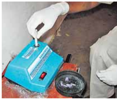
Used needles and syringes being destroyed

"We have despatched one lakh doses of vaccines which are enough for vaccinating one lakh people. If a person com-